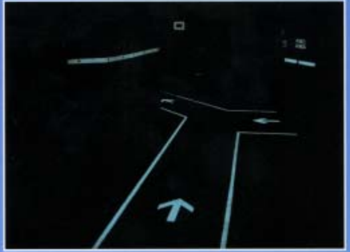
LIGHTIVE COAT test application on the stop line (Daytime and Night time)