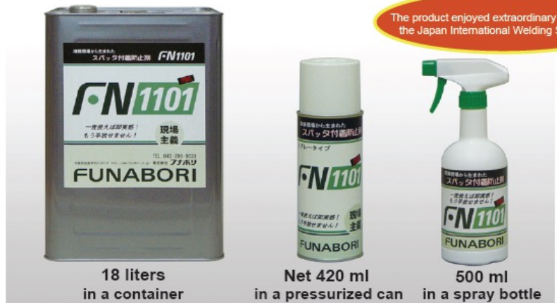
18 liters in a container

The product enjoyed extraordinary popularity at the Japan International Welding Show 2012.